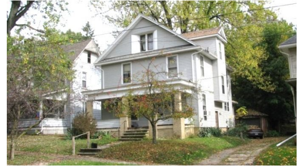
A Wayne County Home recently improved with CHIP