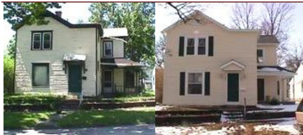
A CHIP Rehabilitation Project before (Left) and after (Right)